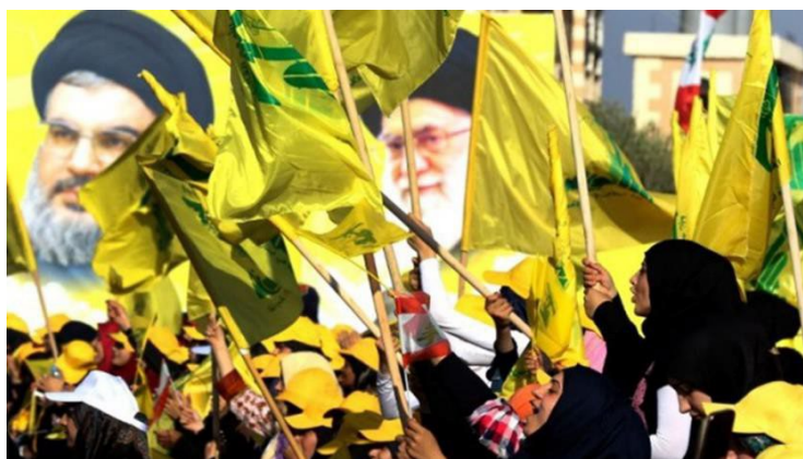
Hezbollah rally in Bint Jbeil, Lebanon

Equally important is Hezbollah's soft power approach, which serves to implant and spread Iran's revolutionary ideology in the areas of southern Lebanon under Hezbollah control. Hezbollah acts as more than just a "resistance" organization, it is a political party as well whose potency lies in the network of social services, hospitals, mosques, charities, and even a satellite TV network, Al-Manar, that the group operates with an annual budget of $15 million. Hezbollah's provision of essential services, such as garbage collection