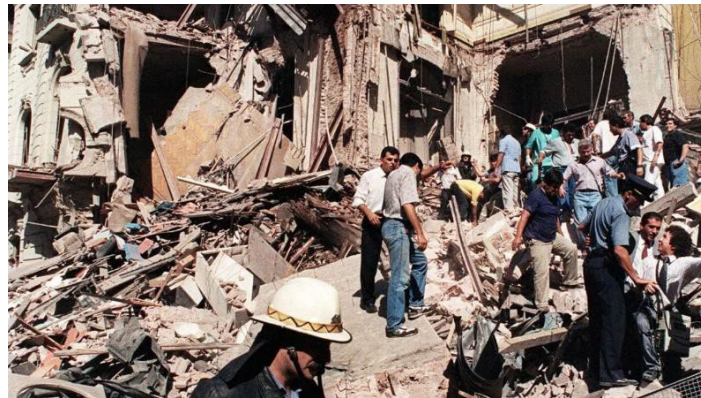
Aftermath of the 1992 Israeli Embassy bombing in Buenos Aires