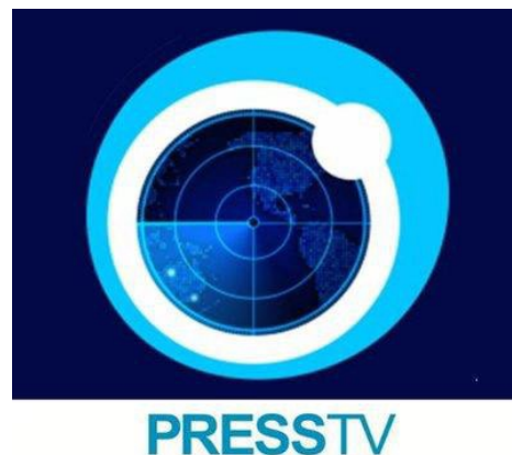
PressTV Logo

The IRIB inaugurated its 24/7 English-language satellite channel, PressTV, in July 2007. Headquartered in Tehran, the network employed correspondents in Washington, New York, Moscow, Rome, Cairo, London, Brussels and Beijing and operated bureaus in Beirut, Gaza and the West Bank immediately upon its inception. PressTV debuted during a period of Iranian concern over military encirclement by the U.S. presence in Iraq and Afghanistan and intensifying international pressure over Iran’s illicit nuclear program. Iran thus viewed PressTV as a means for Iran to reach Western audiences and defend the regime’s nuclear pursuits, foreign policy, support for “resistance” movements, and human rights record.