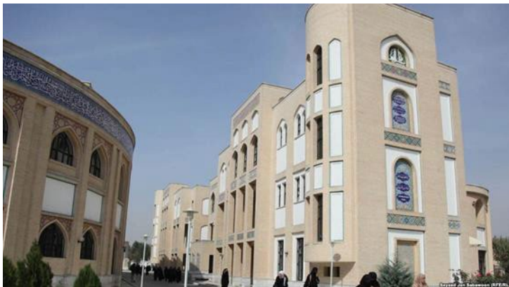
Khatam al-Nabiyeen University campus in western Kabul

The inclusion rhetoric obscures Iran's true intentions in Afghanistan. Under the banner of supporting the Hazara's fight for self-defense , Iran could grow armed militias whose devotion lies with the Supreme Leader of Iran, especially after the Taliban took over Afghanistan following the U.S. withdrawal. As in other areas where Iranian-backed militias operate, these would have the potential to exert influence over the government and advance Iranian foreign policy interests.