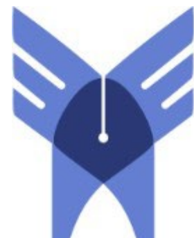
Islamic Azad University Logo

Overview: Islamic Azad University (IAU) was established in 1982 as a nominally private technical and engineering university by a decree of Ayatollah Khomeini . Ali Akbar Hashemi Rafsanjani, a member of Ayatollah Khomeini's inner circle and two-term former president, played the leading role in conceptualizing and establishing Islamic Azad University , and went on to serve as head of the university's founder's committee, akin to chairman of the board, for over three decades until his death in January 2017. Rafsanjani was known as a pragmatic backer of limited social and economic liberalization, rather than ideological rigidity, as the best possible guarantor of sustaining Iran's Islamic Revolution.