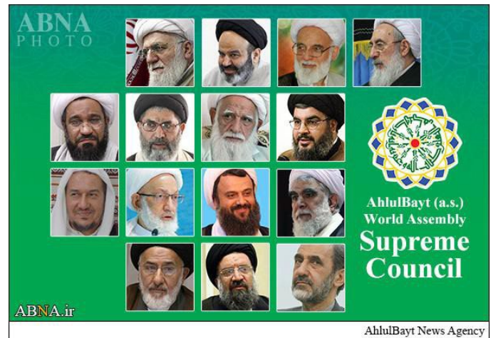
AhlulBayt World Assembly Supreme Council

Overview: The Ahlul Bayt World Assembly (ABWA) is an internationally-active Iranian NGO which functions as the umbrella over a network of Iranian-backed religious, cultural, and educational institutions tasked with disseminating Ayatollah Khomeini's revolutionary Islamist ideology around the world. Ahlul Bayt refers to the " People of the House (of the Prophet) ," and in the Iranian context specifically refers to Shi'a Muslims (partisans of, or Shi'at 'Ali). The ABWA is functionally the link between the Iranian Shi'a clerical establishment and foreign Shi'a clerics , and also links Shi'a communities around the world to each other.