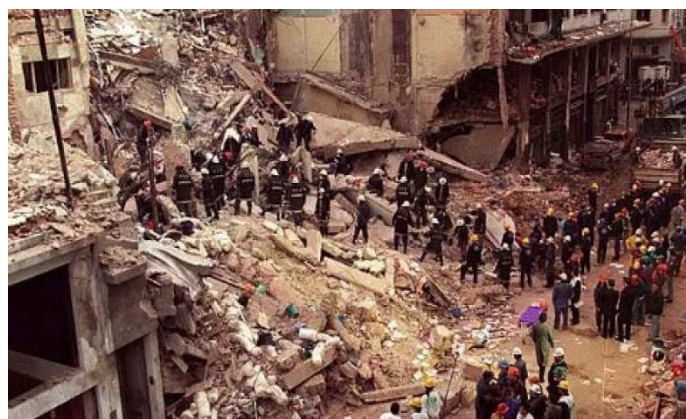
Aftermath of the 1994 AMIA bombing

Less than two years after the attack on the Israeli Embassy, as investigators were still in the process of piecing together what had happened, Iran carried out another bombing targeting Buenos Aires’ Jewish community. On the morning of July 18, 1994, a Hezbollah operative detonated a suicide car bomb laden with 300-400 kilograms of explosives in front of the Asociación Mutual Israelita Argentina (AMIA) Jewish community center , killing 85 and wounding over 200.