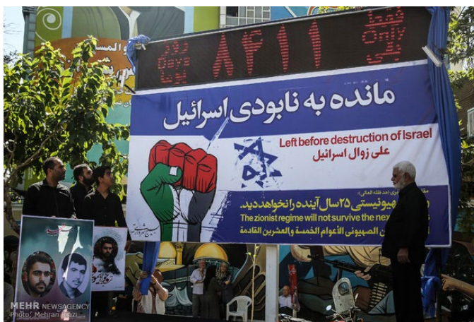
Countdown until Israel’s destruction

Overview: Held annually on the last Friday of Ramadan, Quds Day is a day of protest organized by the Iranian government against Israel. Established by Ayatollah Khomeini months after assuming power in 1979, Khomeini envisioned Quds Day as part of a “long-term pragmatic strategy in a bid to launch a justice-based peace in the region and reclaim the rights of the oppressed Palestinian nation.” which entails the elimination of “Zionist” control over Israel and the return of Israel to the Palestinians. Iran and its surrogates around the world stage ceremonies which typically feature calls for hostilities against Israel and the elimination of the “Zionist regime.” “Death to Israel” is a common chant at the rallies, often accompanied by “Death to America,” and flag burning of Iran’s chief adversaries are a staple of the events.