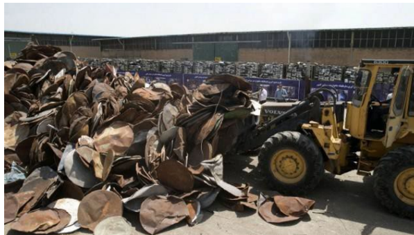
Ceremonial destruction of satellite dishes in Tehran

While IRIB's heavy-handed methods have given its news programs a reputation for peddling pro-regime propaganda, a 2012 U.S. government funded survey found that 86% of Iranians still count IRIB among their top three sources of news, even though only half of the respondents classified IRIB's news content as "very trustworthy." IRIB continues to dominate Iranian news consumption despite the mounted challenge posed by Persian-language news offerings by Western media organs, such as BBC and Voice of America, seeking to provide an alternative point of view to Iranian audiences. Iranian authorities regard these broadcasts with fear and mistrust, viewing them as a threat to their continued cultural hegemony. Iran accordingly invests heavily in censorship efforts, including jamming of international satellite broadcasts. Iranian police also regularly conduct raids to seize illegally possessed satellite dishes, and the IRGC's Basij militia have staged ceremonies in which they destroy massive quantities of the corrupting devices.