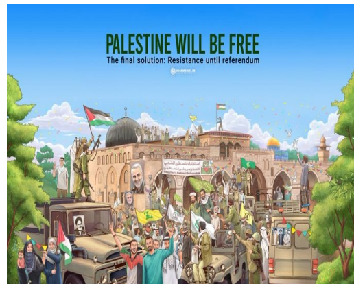
2020 Quds Day Poster