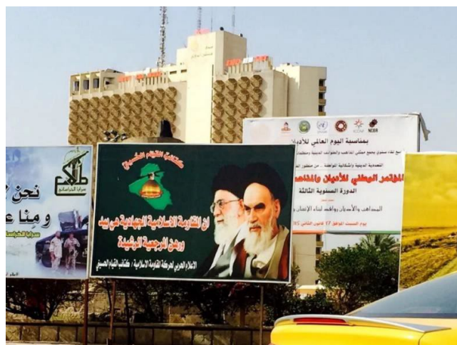
Billboard depicting Iran's current and former Supreme Leader in the Baghdad square where U.S. Marines previously toppled a statue of Saddam Hussein in 2003

Following the "Hezbollah model" of dispensing patronage in the form of security and social welfare to fill vacuums created by the weak central government, Iran—through its control over Shi'a militias, affiliated charitable organizations, and a heavy media presence—has transformed one of its former greatest adversaries into a client state and a " jumping-off point to spread Iranian influence around the region ." Much as Hezbollah has translated its influence in Lebanon into political clout, Iraq's Shi'a militias translated popular support into a law passed in November 2016 recognizing the PMF as a government entity operating alongside the military , enshrining their legitimacy into law and ensuring funding from the Iraqi government for their operations, which has only served to deepen sectarian tensions.