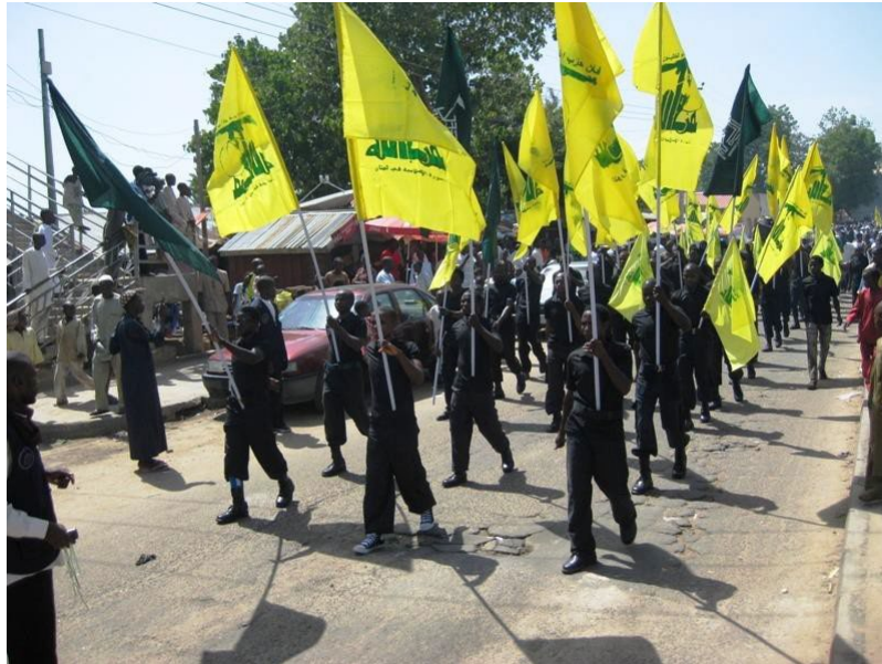
IMN members march with Hezbollah flags during 2015 Quds Day rally

predicated on velayat-e faqih . While the IMN claims to be an exclusively peaceful Islamist movement, it has a checkered history of low-level militant activities and confrontations with Nigerian security forces that have led to the imprisonment of hundreds of the group's members since the 1980s. Both Nigerian intelligence and U.S. embassy cables have reported that the group operates paramilitary training camps in northern Nigeria. The group has hundreds of paramilitary guards, called hurras, who are not armed so as to avoid a direct confrontation with the state, but who “are a uniformed, regimented organization modeled on the Revolutionary Guard that carries Hizb Allah’s flag as their emblem.”