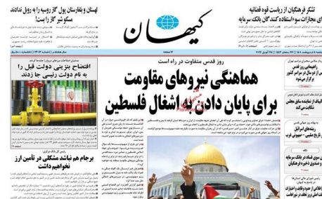
Kayhan, April 28, 2022

In the lead up to Quds Day in 2022, Gaza militants again fired rockets into Israeli territory, however this time no group claimed responsibility for the attacks. It was reported that Ali Akbar Velayati, foreign policy advisor of Iran’s Supreme Leader, spoke via phone with Hamas political bureau chief Ismail Haniyeh and Secretary General of the Palestinian Islamic Jihad Movement Ziyad al-Nakhalah . Separately, Iran’s foreign minister, Hossein Amir Abdollahian , engaged in phone calls with the leadership of Hamas and Palestinian Islamic Jihad. Furthermore, the Commander-in-Chief of Iran’s IRGC, Hossein Salami , addressed Gaza via live video link from Tehran, an act which Axis of Resistance media hailed as the first time the IRGC commander-in-chief had done so. For Quds Day in 2022, Kayhan also featured a guest editorial where the author openly praised Nazi Fuhrer Adolf Hitler, arguing he was “smarter and more courageous” than current European leaders for expelling Jews.