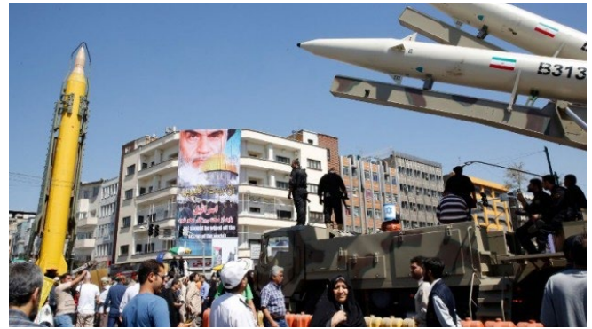
Ballistic missiles on display

Quds Day in 2020 is scheduled for Friday, May 22. Iran, which has been especially hard hit by the coronavirus, weighed canceling this year's demonstrations or moving them online. Ultimately, Iran has decided to mark Quds Day with a vehicle procession , placing the Islamic Revolutionary Guard Corps in charge of planning the parade routes and encouraging demonstrators to chant slogans and wave flags from their cars. The decision to put on a modified Quds Day underscores that even a pandemic will not deter the Iranian regime from holding its annual display of demonization of Israel.