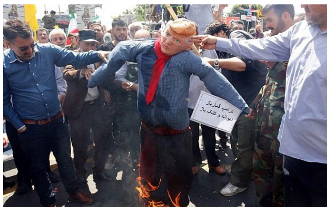
Demonstrators burning effigy of President Trump

Iranian politicians abidingly attend Quds Day rallies and deliver anti-Israel diatribes to showcase their steadfast commitment to the regime’s opposition to Israel. Tehran’s May 2019 Quds Day festivities were centered around Iran’s rejection of the Trump administration’s forthcoming Israeli-Palestinian peace plan, branded as “the deal of the century.” The procession featured numerous examples of incitement , including demonstrators burning American and Israeli flags and effigies of President Trump and Prime Minister Benjamin Netanyahu. In remarks to reporters, then-President Hassan Rouhani declared , "Palestinians will definitely emerge victorious in confrontation with the Zionist aggressors. ... The issue of Deal of the Century will