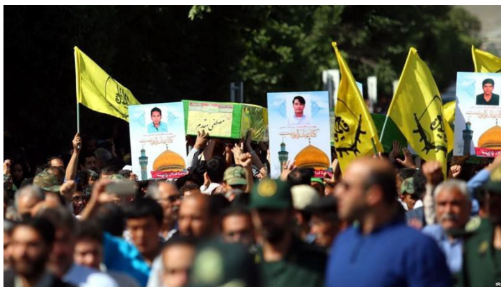
Funeral for Afghan Fatemiyoun Brigade fighters killed in Syria. Posters feature Sayyeda Zainab shrine.

Iran has also sought to frame the fighting in Syria as an urgent necessity to defend Shi’a shrines . The golden-domed Sayyeda Zainab shrine, strategically located in south Damascus, is especially central to this narrative of Iran and its proxy fighters. Attendees at funerals for Lebanese Hezbollah and other Shi’a militia fighters killed in Syria frequently chant “labayk ya Zainab (At your service, O Zainab) , and these same groups have also produced propagandistic songs featuring the slogan and prominently placed the shrine’s iconic dome in the background of martyrdom posters of fallen fighters.