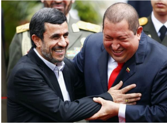
Iran's President Mahmoud Ahmadinejad is welcomed by Venezuela's President Hugo Chavez at Miraflores Palace in Caracas in 2012

Venezuelan leader Hugo Chavez and former Cuban leader Fidel Castro. The ALBA project has been characterized by its member nations' desire to supplant U.S. dominance in the region, and in Iran, they found a willing anti-American strategic partner. Iran has joined ALBA's intergovernmental association as an observer state, providing it a forum " to have conversations with countries it otherwise would not have the ability to talk to , such as Ecuador, Bolivia, and Nicaragua.