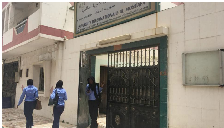
Al-Mustafa University branch in Dakar, Senegal

Al-Mustafa International University has also established a branch in Dakar, indoctrinating 150 Senegalese students each year into Khomeinist ideology. The students receive “free tuition, a stipend, and breakfast” to entice them, and are expected to “promote Iran online or in books” in return for the Iranian largesse. They are also given enough money to enable them and their families to visit Qom during the course of their studies, furthering their indoctrination.