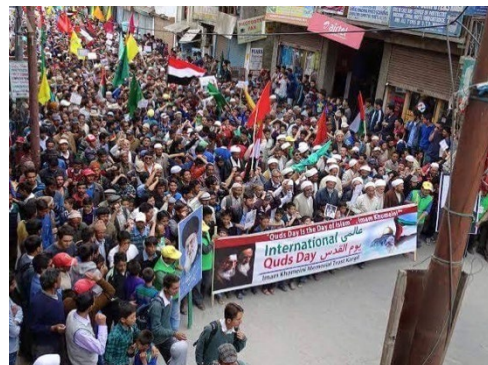
Quds Day rally in Kashmir

Although Hezbollah itself draws no distinction between its military and political wings, the European Union has designated only the military wing of Hezbollah as terrorist organization, allowing the group to overtly organize, demonstrate, and carry out fundraising activities throughout the continent. The Iranian terrorist proxy has therefore played a prominent role at Quds Day rallies in European capitals such as London and Berlin