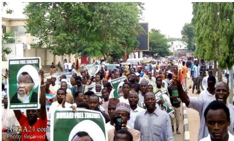
IMN members stage "Free Zakzaky" protest in Abuja, Nigeria in May 2018

penchant for extreme rhetoric, Zakzaky has largely discouraged physical confrontation with the Nigerian state. The IMN has several younger potential successors waiting in the wings who are more "radical and violence-prone" than Zakzaky, further exacerbating concerns of future sectarian strife in Nigeria.