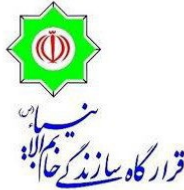
Khatam al-Anbiya Logo

As the Iranian government reduced military expenditures and sought to rebuild after the war, the IRGC's construction and engineering wing, Khatam al-Anbiya ("seal of the Prophets"), moved into civilian enterprises, expanding its influence and economic portfolio as it took on lucrative post-war reconstruction projects. This process accelerated during Ahmadinejad's tenure, as Khatam al-Anbiya was the beneficiary of a succession of huge no-bid contracts , rendering the organization and its complex web of subsidiaries as the dominant players in Iran's construction, energy, automobile manufacturing, and electronics sectors . Fueled by Khatam al-Anbiya's profits, the IRGC has taken on outsized role in the militarization of Iran's economy and the organization effectively operates as a state within a state, accountable only to Supreme Leader Khamenei. Reflecting the IRGC's growing influence in Iran's oil and gas industry, Khatam al-Anbiya has served as a recruiting pool for top talent for the government of the Islamic Republic of Iran. IRGC commander and former Khatam al-Anbiya head Rostam Ghasemi was appointed as Iran's Minister of Petroleum in August 2011.