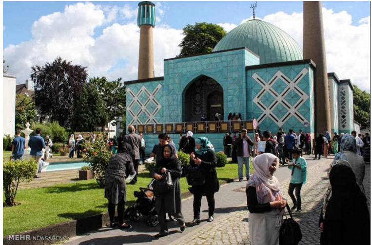
Imam Ali Mosque in Hamburg, Germany

Hezbollah maintains a robust presence in Germany. According to an October 2017 report of the Federal Office of the Protection of the Constitution, Germany's domestic intelligence agency, there are 950 active Hezbollah members in Germany , classified as belonging to the organization's "political wing," a number which has remained steady for over a decade. The Hezbollah supporters regularly meet at Iran-backed mosques and Islamic community centers around the country. There are believed to be around 30 such institutions in this pro-Iranian network, including the Imam Mahdi Centre in Münster-Hiltrup , the Imam Reza mosque in Berlin , and the Imam Ali Mosque in Hamburg . The ongoing Middle Eastern refugee crisis further compounds the security risk posed to Germany by Hezbollah. The 2017 intelligence report states that, " Since mid-2015 there are increased indications of fighters from Shi'ite militias entering Germany as legal refugees. "