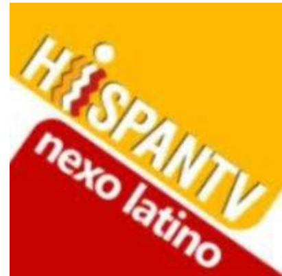
HispanTV Logo

HispanTV is the IRIB's Tehran-based Spanish language network, which airs throughout Latin America and Spain. The network serves as an arm of Iran's public diplomacy outreach to Latin America, a region in which Iran has invested significant political capital. According to Iranian officials, the goal of HispanTV is to "broaden the Iranian regime's ideological legitimacy" among friendly governments in the region—and to diminish the influence of dominance seekers," a thinly-veiled reference to the United States."