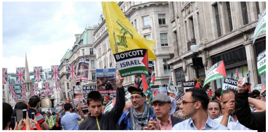
Hezbollah flag at Quds Day rally in London, U.K.

encouraging advisory ahead of the rally informing attendees that “you can bring a Hezbollah flag to show support for the political wing of Hezbollah ... because the political wing of Hezbollah is not a proscribed organization.” Notably, Hezbollah has only one flag for its military and political wings—which prominently features an assault rifle—casting suspicion on IHRC’s disclaimer that its promotion of Hezbollah flags at Quds Day events in no way demonstrates