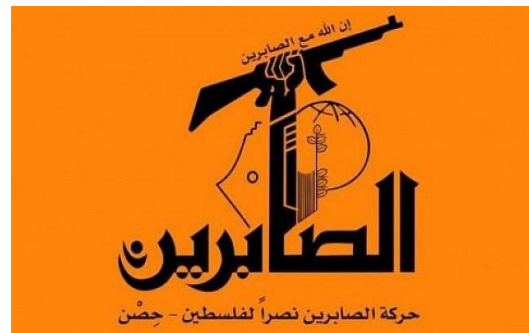
Al-Sabirin movement's flag

Iran has been the leading sponsor of Gaza-based Palestinian Islamic Jihad (PIJ) , which was founded in 1979, inspired by the success of the Islamic Revolution. Iranian funding of PIJ has been in place since 1987 . During the early 1990s, much of PIJ organizational and operations-based support came from the Iranian sub-group Hezbollah . The PIJ is extremely open about Iran being its main supporter: “ All of the weapons in Gaza are provided by Iran... the largest share of this financial and military support is coming from Iran. ” It should be noted that while Iran is PIJ’s main supporter, PIJ is neither an arm of Iran’s Islamic Revolution nor a vehicle for spreading Iran-style Shiism in the Palestinian territories, although it has faced such accusations as a means of discrediting the organization among the Palestinian populace. Still, PIJ’s leadership has expressed admiration for Iran’s Islamic Revolution for reviving the overall cause of radical Islamism and jihadism , and the group has adopted a conciliatory posture toward Shiites, viewing them as members of the community of Muslim believers, unlike other Sunni jihadist organizations which consider Shiism to be heretical.