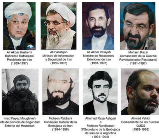
International arrest warrants issued by Argentinean court for Iranian and Hezbollah officials