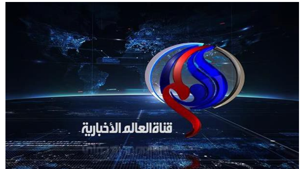
Al-Alam Logo

Al-Alam (The World) is IRIB’s 24-hour Arabic language news channel with news bureaus based in Baghdad, Beirut, Damascus, and Tehran . The network advocates for and seeks to advance the interests of the Iranian regime to the world’s 300 million Arabs, and its satellite programming reaches viewers on five continents. Al-Alam offers a mouthpiece for Iran to influence Arab public opinion and shape perceptions of events on the ground in real time in accordance with the Iranian establishment’s perspective.