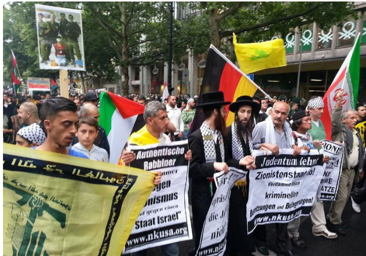
2014 Berlin Quds Day march

The IZH is involved in the organization of the march, and funds buses of pro-Hezbollah, pro-Iranian regime activists to the event from the Imam Ali mosque in Hamburg, which the IZH operates. Prominent displays of Hezbollah flags and posters of Shi'a and "resistance axis" leaders , such as Ayatollahs Khomeini and Khamenei , Hassan Nasrallah , and Bashar al-Assad have been a fixture at the Quds Day rallies, although in 2016, the Berlin State Senate agreed to ban Hezbollah flags at the gathering going forward.